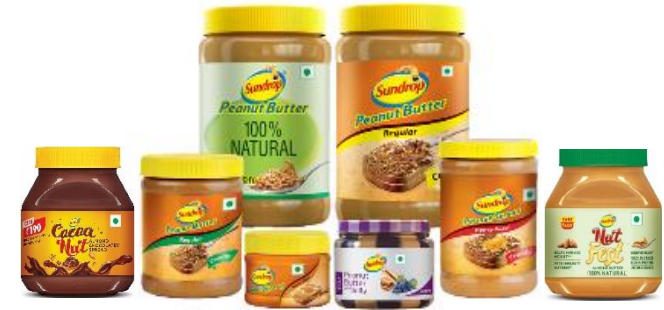
3. Spreads (Rs. 2300 crore)