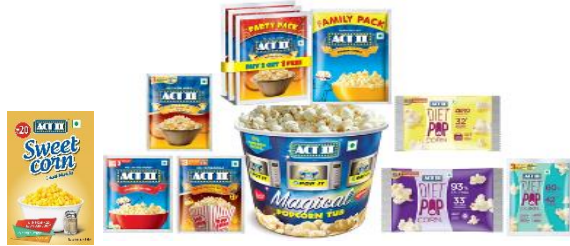
1. Ready to Cook Snacks (Rs. 10,000 crore)