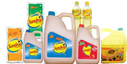
6. Edible Oils (Rs. 194,000 crore)