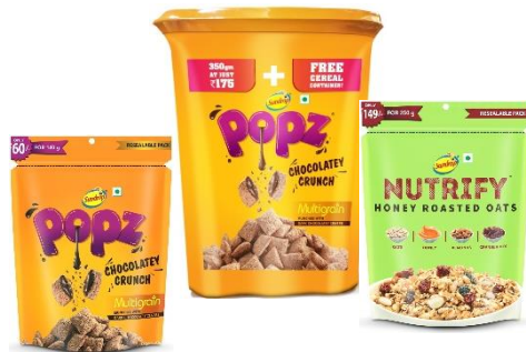
4. Breakfast Cereals (Rs. 2900 crore)