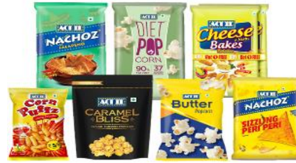
2. Ready to Eat Snacks (Rs. 35,000 crore)