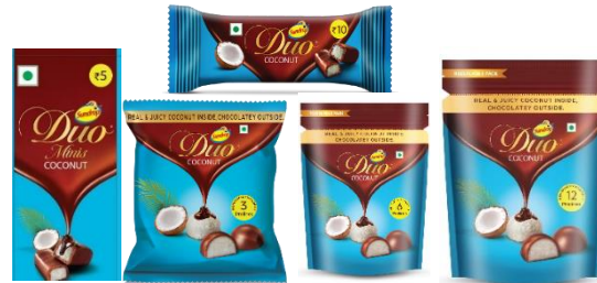
5. Chocolate Confectionery (Rs.15,000 crore)